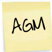
Annual General Meeting June 22, 2026