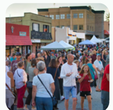
Blackberry Festival August 21, 2026