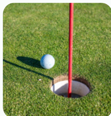
Chamber Cup May 30, 2026

For information how to join, attend, or reserve your vendor spot please email: office@powellriverchamber.com